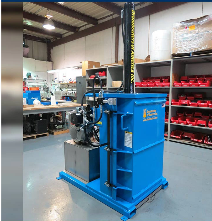
DC7000 10HP Diesel