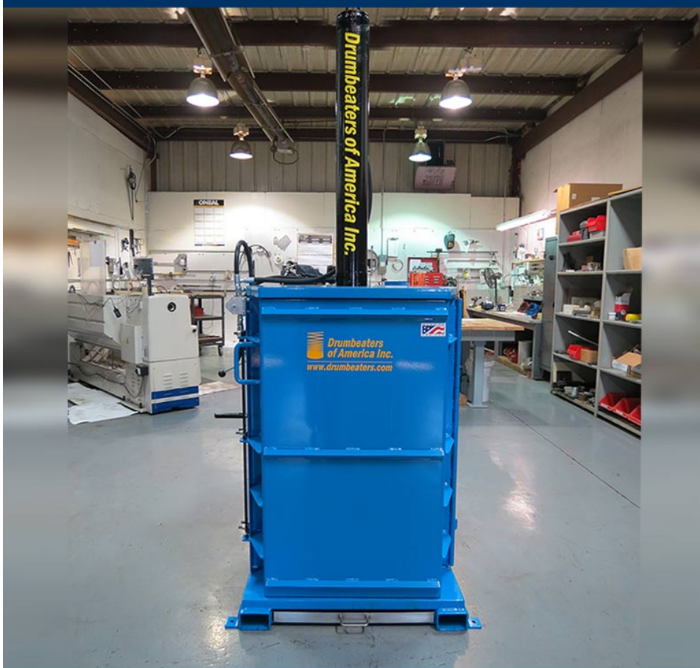
Model DC5000-10 Diesel